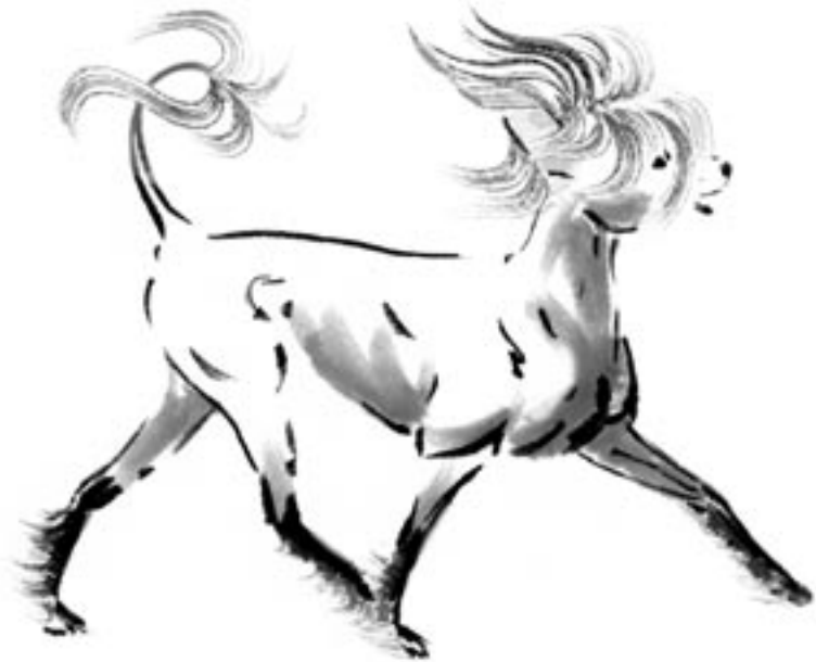
Chinese Crested Dog