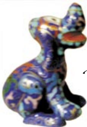
Exhibit runs February 4 to March 2